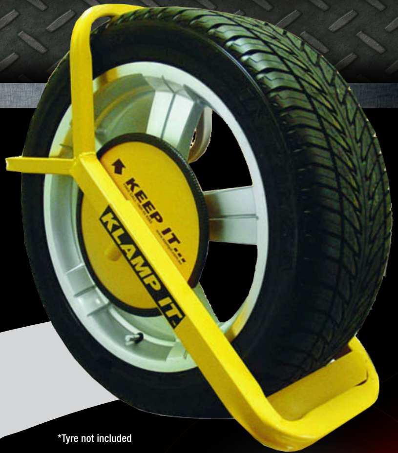
*Tyre not included